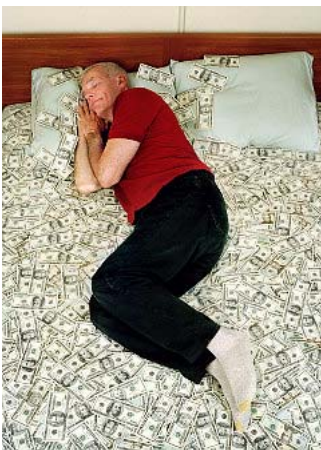
"Money Never Sleeps."